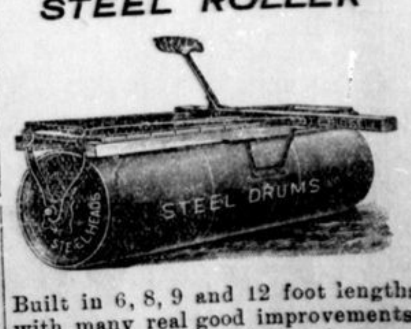
STEEL ROLLER Built in 6, 8, 9 and 12 foot lengths with many real good improvements. Full particulars will be given, so don't hesitate to inquire.