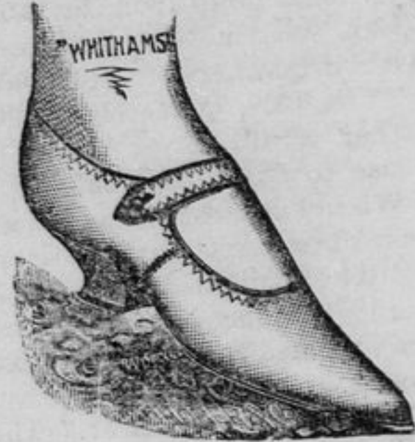
In Patent Leather or Calf, Reg $2.00, Tuesday $1.50 pr.