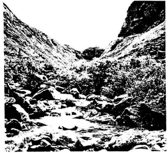
What looks easy from a distance is really an exhausting portage