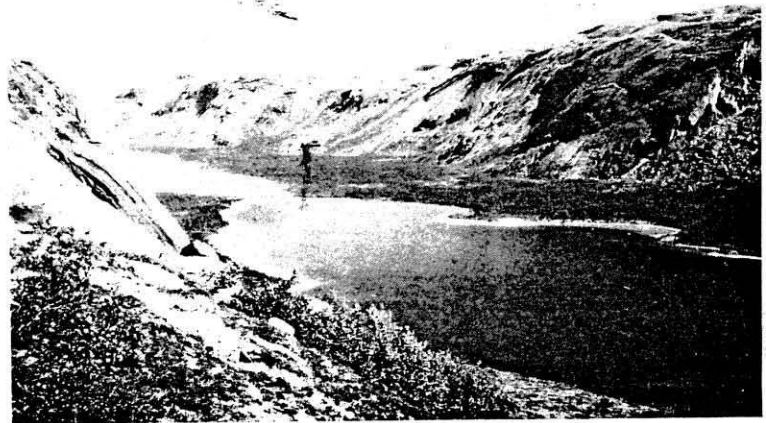
The valley runs like a deep scar almost perfectly straight from east to west