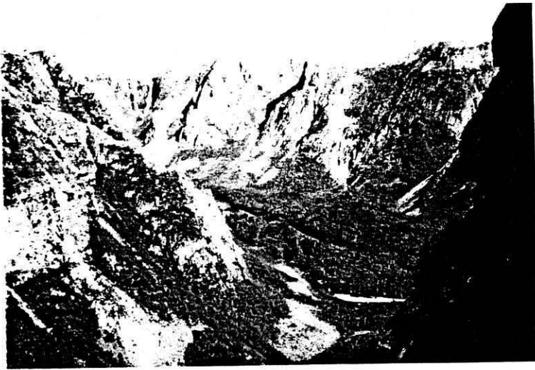
A look upstream from the mouth of Bear Ravine