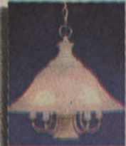
LPP 3018 FV Reg.: $229.00 Sale: $149.00