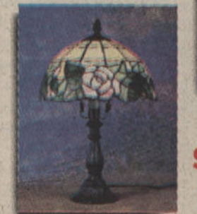
FTF-046-OAB 10" (D) X 15" (H) Reg.: $89.00 Sale: $59.00