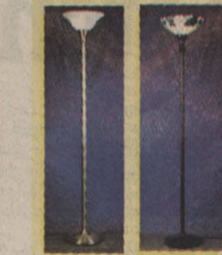
FL 7534/DAB or PB Reg.: $159.00 Sale: $99.99