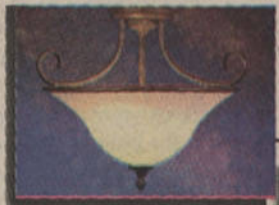
SML 8013C RT Reg.: $135.00 Sale: $89.99