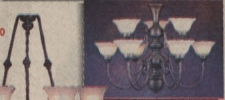
LPW 3009 G-FW Reg.: $499.00 Sale: $379.99