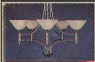
SML 305 GG 27" (D) X 29" (H) Reg.: $285.00 Sale: $129.00