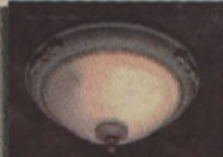
SML 111 FV Reg.: $59.00 Sale: $34.99