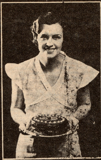
A GOOD COOK This Means Most of All