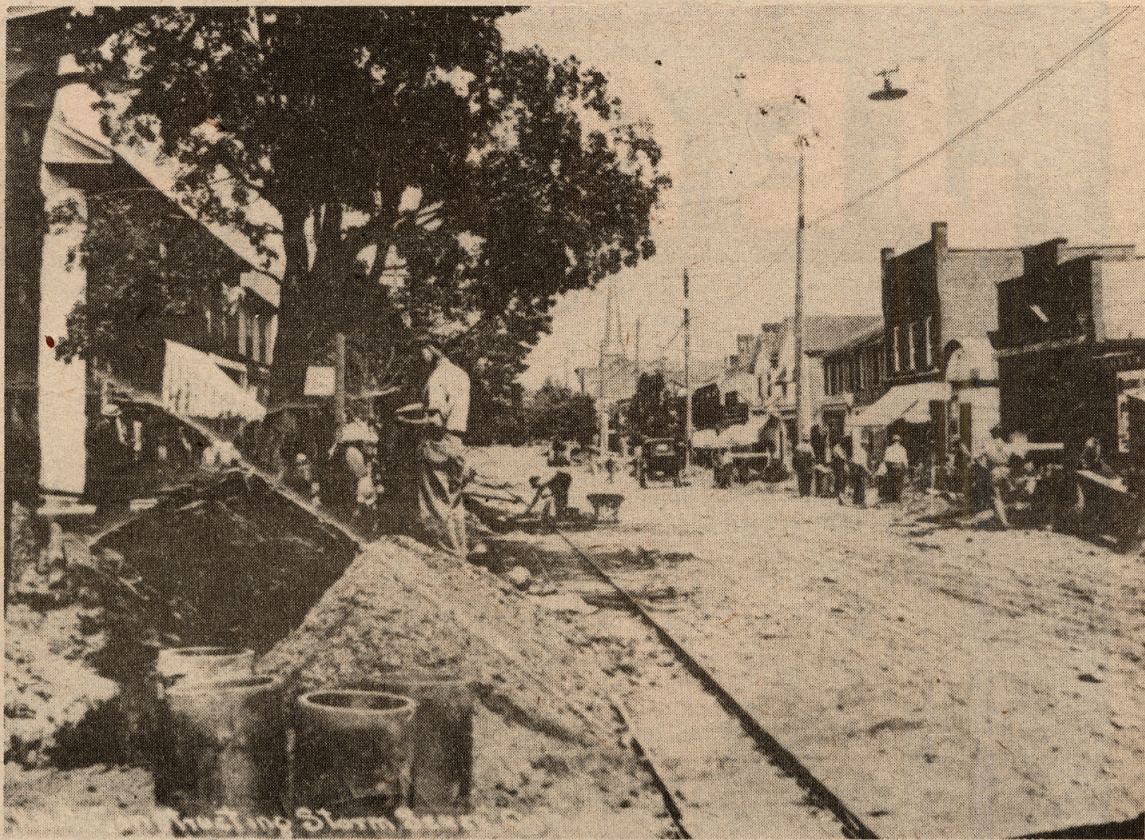
Storm sewer construction and paving work on Colborne Street, now Lakeshore Road. (Courtesy Oakville Historical Society).

Plank sidewalks were laid along each side of Colborne Street (Lakeshore Road) in 1849 by public subscription. The next year the township agreed to a special assessment on Oakville property to raise 50 pounds to lay a walk on the east side of Navy Street to the pier. In 1855 plank walks were laid to the Temperance Hall, the Roman Catholic and Presbyterian churches, the schoolhouse, and across the Sixteen Mile Creek to the top of the hill beyond the foundry. The total cost of the work was 210 pounds, 11 shillings and sixpence.