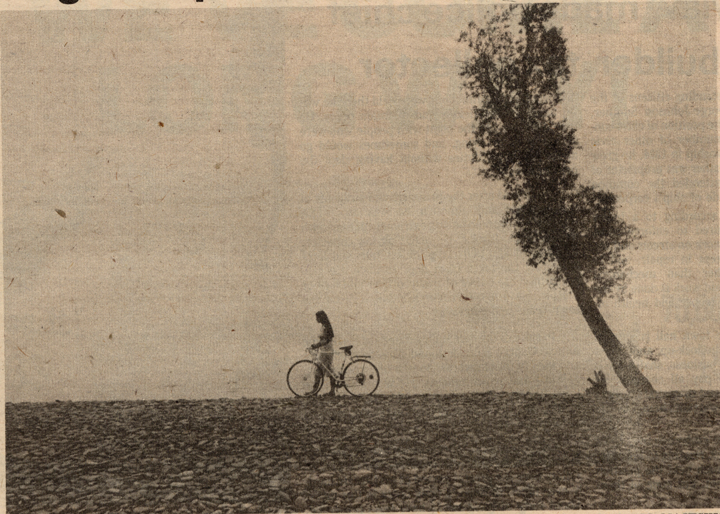
There's plenty of room to roam and relax in Oakville's 500 acres of parkland.

Arenas: Town arenas are open for public skating or for private or league hockey games. In the summer, lacrosse takes over. Public skating charges are 25 cents for children, 35 cents for students and 50 cents for adults. Bronte Creek Provincial Park (outdoor ice surface free skating only) Kinoak Arena