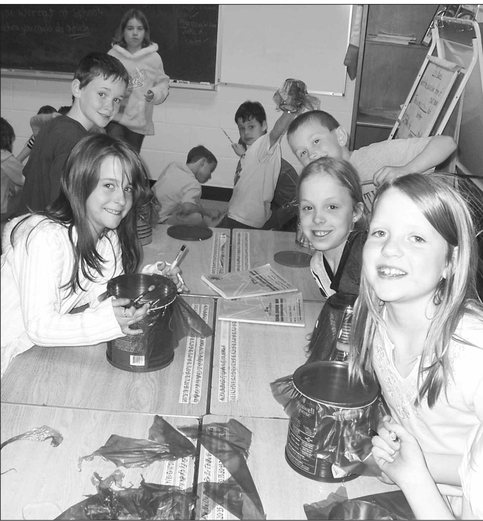
Grade 3 students at Holy Name School are currently studying the concepts of 'beat and rhythm' in Music.