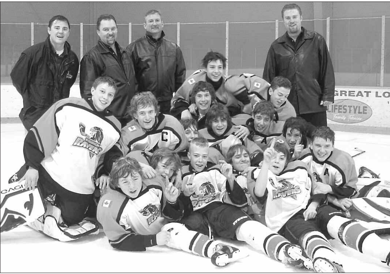
The Essex Bantam A Ravens are the Bluewater Playoff Champions after a 6-3 win against the Belle River Rink Rats on Easter weekend.