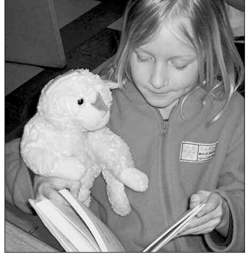
Maplewood students take advantage of last week's book sale and "Read On!"