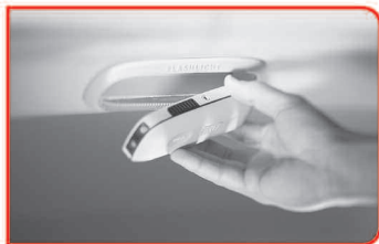
Removable LED Cargo Flashlight