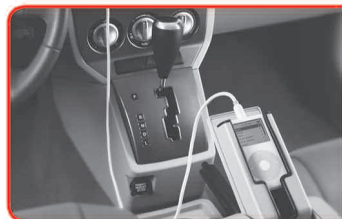
Rubber-lined cradle to hold your MP3 player, PDA or cell phone