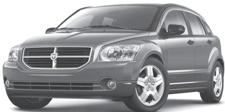
Available on Caliber & Compass...

DaimlerChrysler Canada Employees/Retirees, Get A Great New Vehicle At A Great Employee Price.