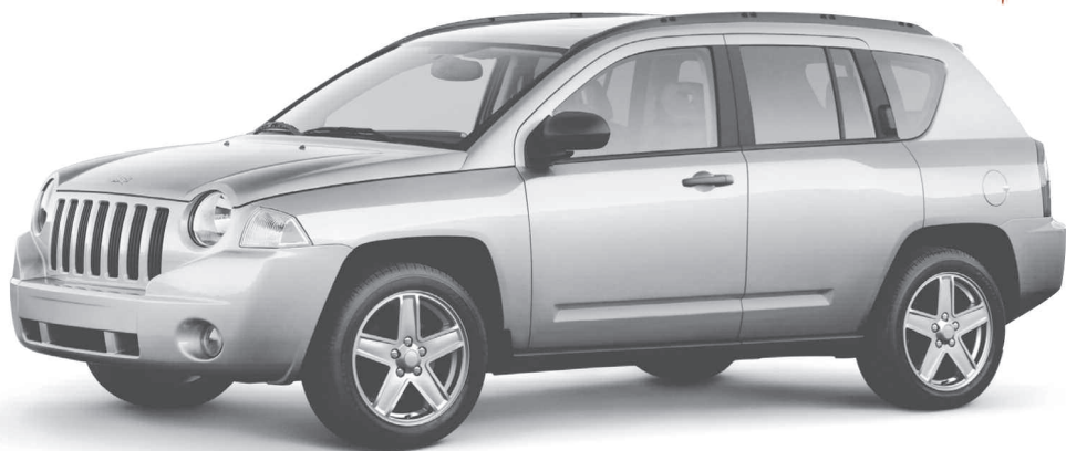
Available on Caliber & Compass...