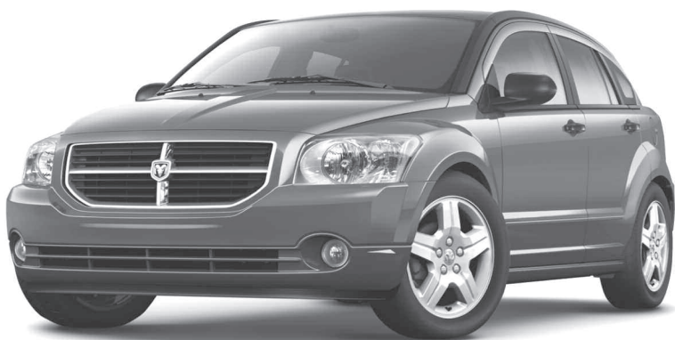
Available on Caliber & Compass...

DaimlerChrysler Canada Employees/Retirees, Get A Great New Vehicle At A Great Employee Price.