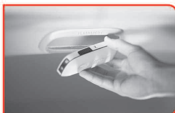
Removable LED Cargo Flashlight