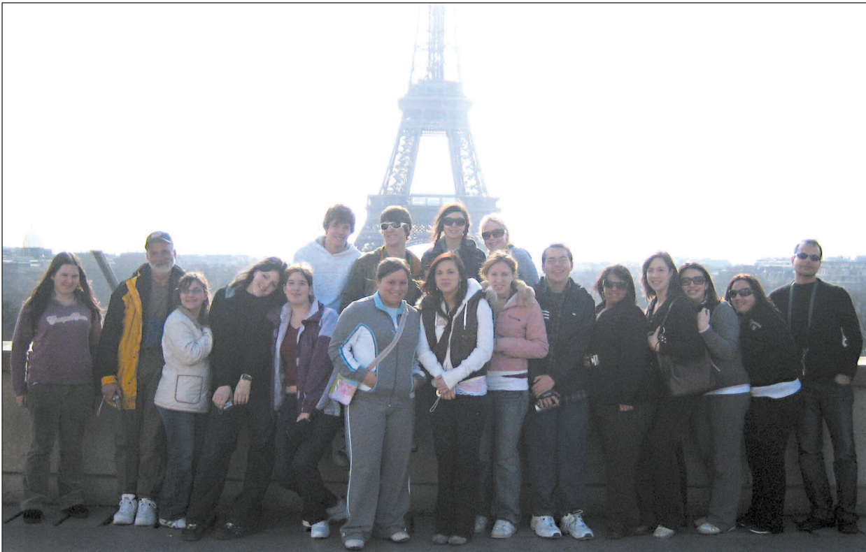
During the March Break, 20 of Cardinal Carter's senior social science students had the opportunity to experience the culture of Europe. Over the 12-day span the group visited three countries: France, Monaco and Italy. Many historical and cultural sites were explored along the way, including the Eiffel Tower, above, the Louvre Museum, the Colosseum, and the Vatican.