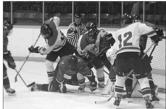
Red Raider boys' hockey team fights for the puck in semi-final hockey action against the Villanova Wildcats, at Essex Arena Feb. 21. Despite determined play by the Raiders, the Wildcats won 3-0.