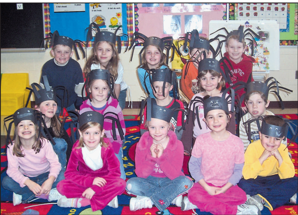
Grade One students at Holy Name School proudly wear their 'Anansi the Spider' hats.

HNS students were busy this week collecting pledges for their upcoming 'Read-a-Thon'. What silly stunts will the teachers of HNS have to perform? What will the grand total be? Who will gather the most pledges and be given the coveted title of 'Principal For the Day'? We will soon find out!