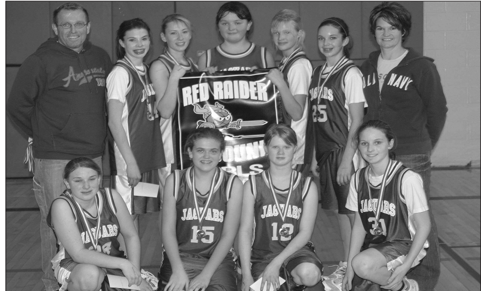
The consolation winners in the boys' Red Raider Rebound were the Gosfield North Cougars, left. The girls' consolation title went to the Jack Miner Jaguars, right.