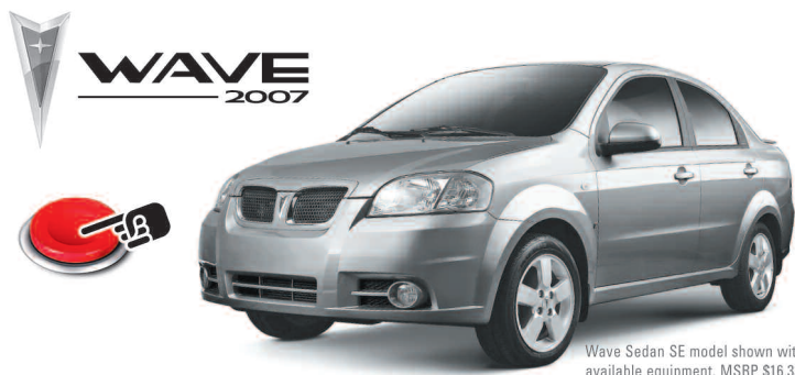
Wave Sedan SE model shown with available equipment. MSRP $16,335