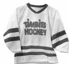
The first goal is having fun.

In Timbits Hockey, a love for the game starts with having a great time on the ice. It's a way for kids to learn basic skills, make new friends and most importantly, have fun. That's why Tim Hortons is proud to support all the girls and boys who play Timbits hockey in the Essex community.