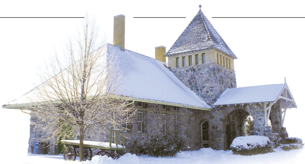
"Serving Essex and Community Since 1896"