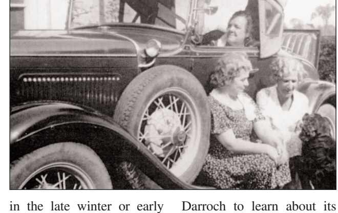
spring of 1931. Its exceptional condition inspired

The car was assembled at the Toronto Ford plant at Danforth and Victoria Park