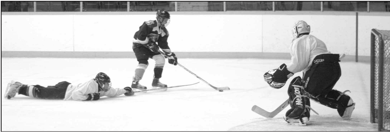
Stretch! - Local hockey enthusiasts, above, took advantage of the holiday time off to play some shinny hockey at Essex Memorial Arena, Dec. 27.