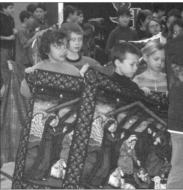
Students at Holy Name School participate in an Advent Wreath Blessing ceremony Dec. 5.