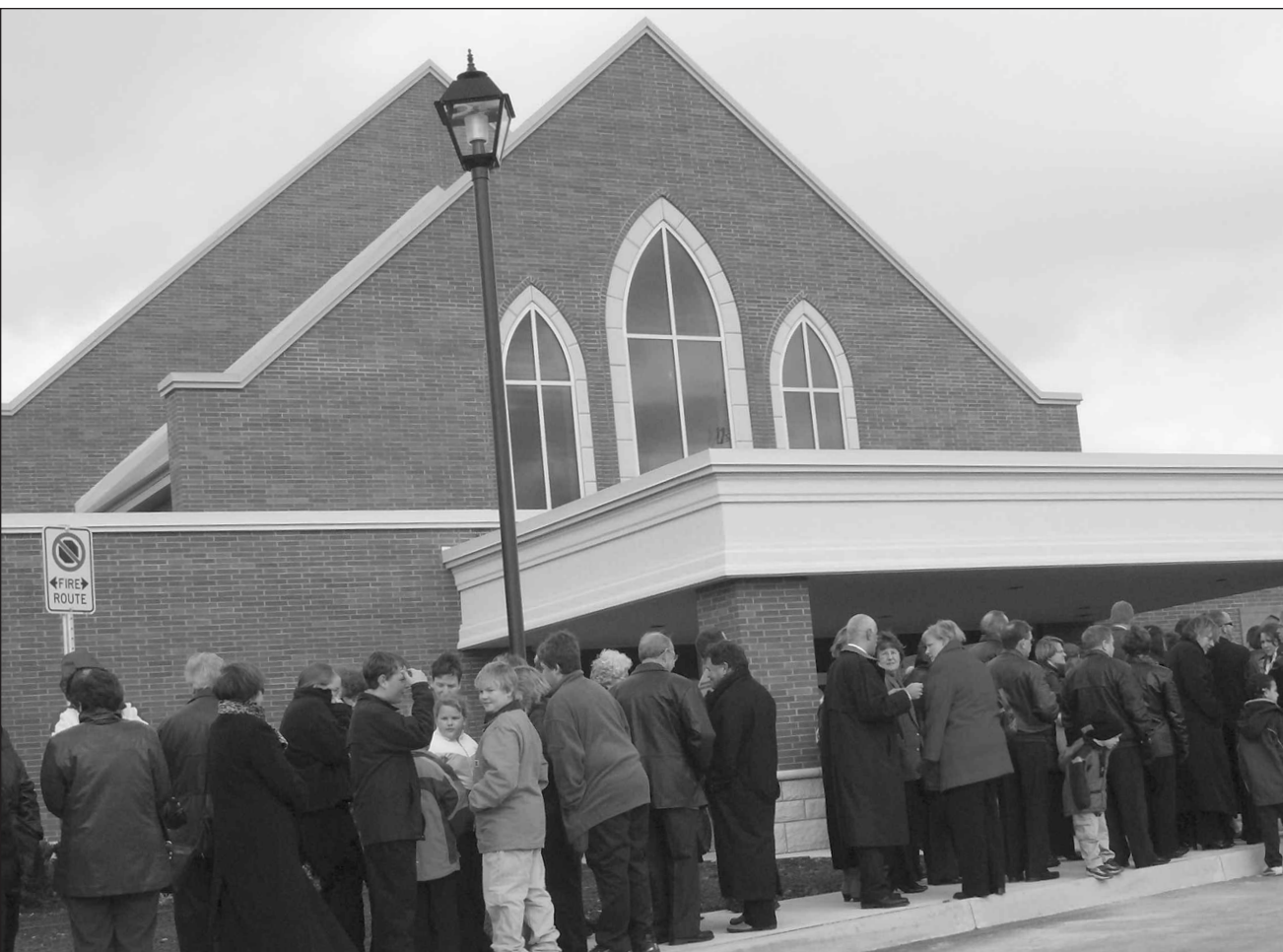
Hundreds of churchgoers line up for the grand opening of Visitation Parish in Comber Dec. 2. The parish hopes to bring together Catholics in an area where community churches have closed in recent years.