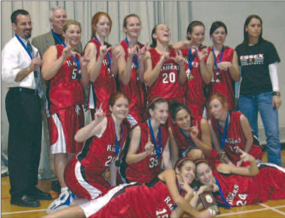
The Essex High Junior Girls' basketball team, above, poses for one last photo for the season. In spite of tremendous support from fans, right, the girls were defeated by Sarnia St. Patrick's High School at the SWOSSAA championship Nov 23.