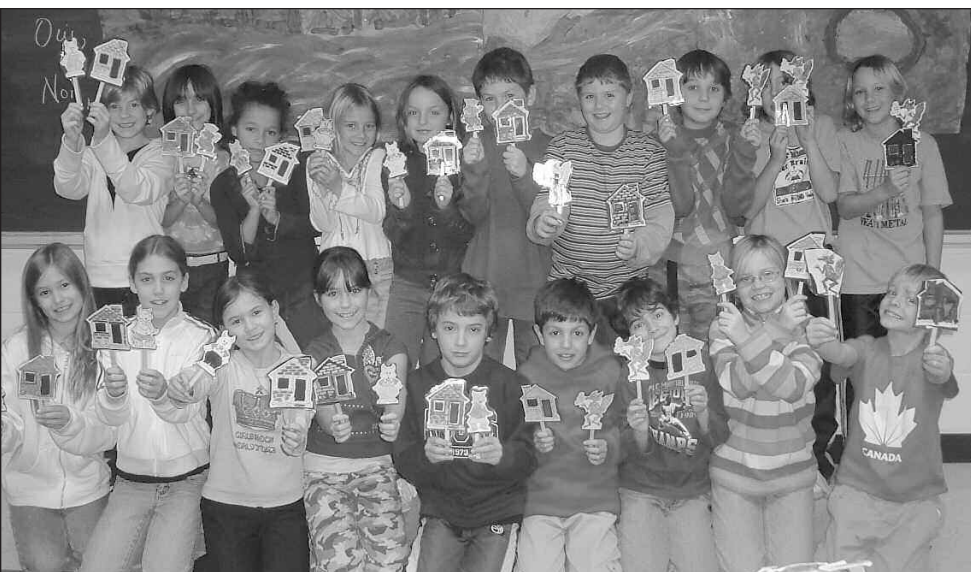
LES TRIOS PETITS COCHONS – Students from Grade 4B at Holy Name Elementary School used puppets to perform the play 'Les trois petits cochons' (The Three Little Pigs). Students have been hard at work for the past month preparing materials, including puppets and backdrops, learning French vocabulary, and practicing the text in order to give their best performances of this, their first major production 'en français'.