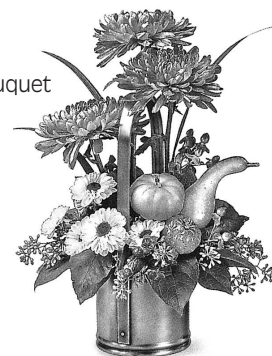
WilliamSBURG® is a mark of the Colonial Williamsburg Foundation.