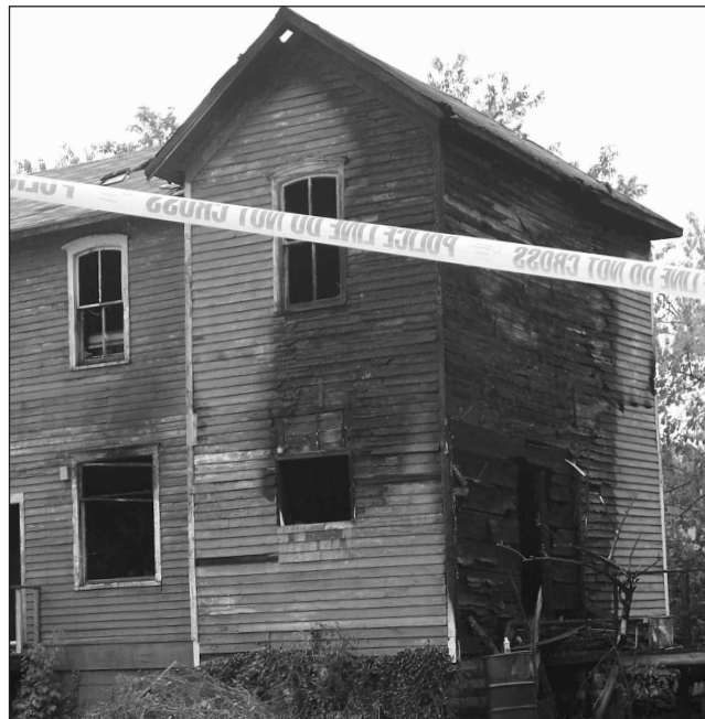
Police tape surrounds the back of a house damaged by a fire Sept. 13 at 139 Talbot St. North. An investigation is ongoing. Fire officials said the blaze likely started behind the home.