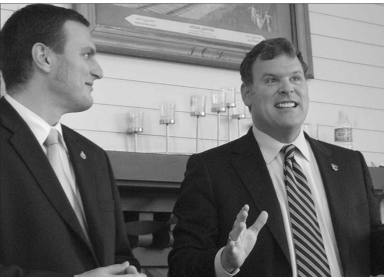
PROMISES FOR ESSEX – Essex MP Jeff Watson, left, and John Baird, president of the Treasury Board, speak to local members of the Conservative party at the Essex Railway Station Friday. The party's Electoral District Association invited Baird to the area as part of the final leg of a tour of Southwestern Ontario. The tour focused on discussing issues such as crime and governmental accountability.