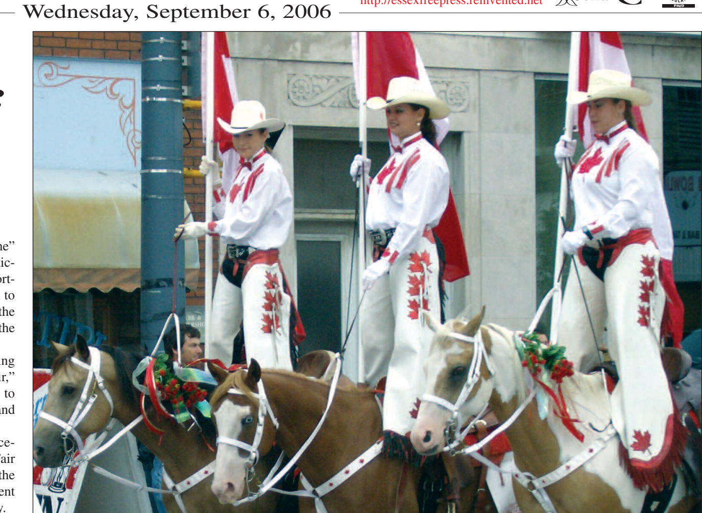
RIDING HIGH – Members of the Chatham-Kent Canadian Cowgirls Rodeo Drill Team ride standing on horseback during 152nd Harrow Fair parade down King Street in Harrow Sept. 2.