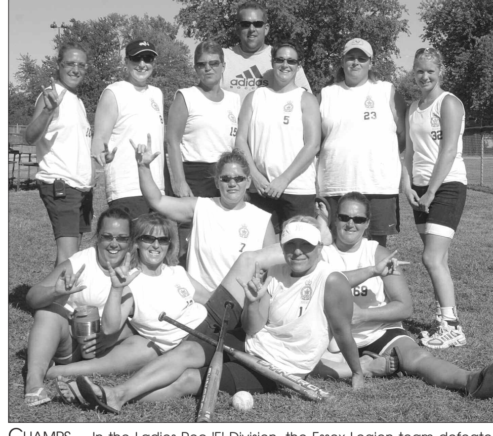
CHAMPS – In the Ladies Rec 'E' Division, the Essex Legion team defeated Barb'z Dolls 8-5, in the 13th Annual Harrow Peach Slo-Pitch Tournament held in Harrow Aug. 11-13.

To find out more, contact the Windsor-Essex Sport Tourism Alliance at 519-253-3616, ext. 233.