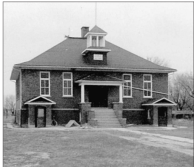
S.S. No. 15