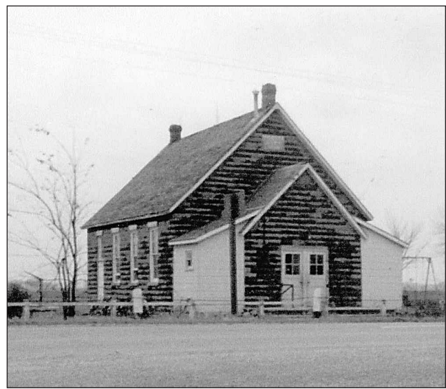
S.S. No. 4