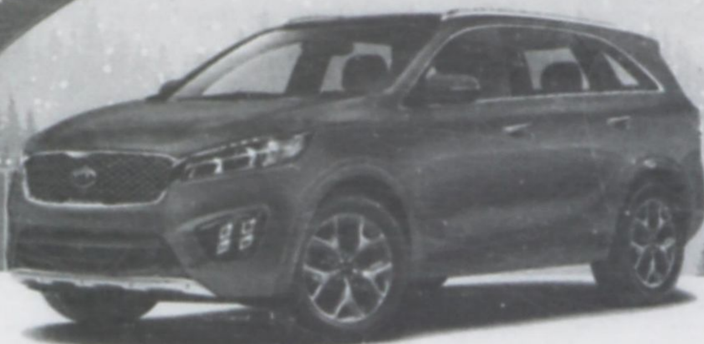
Sorento SX Turbo AWD shown*

UP TO 0% FINANCING FOR UP TO 60 MONTHS + $4,000 IN DISCOUNTS* ON SELECT MODELS + DON'T PAY FOR 90 DAYS* ON ALL MODELS