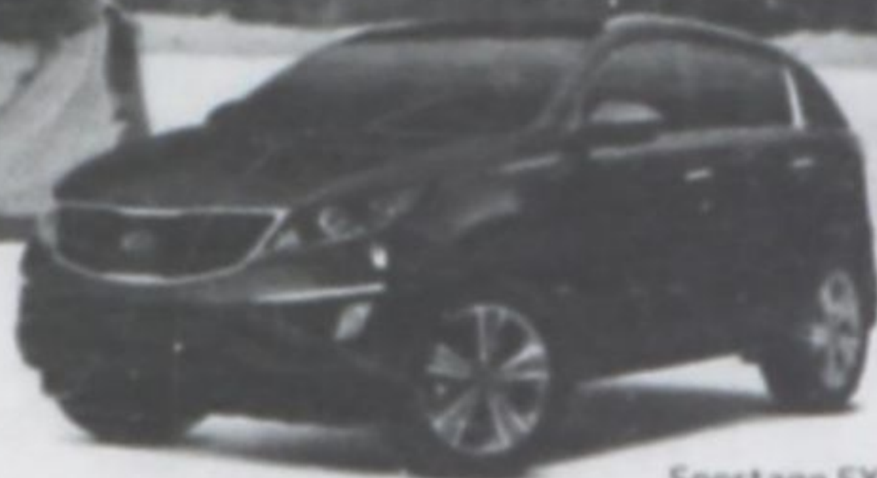
Sportage SX Luxury shown*