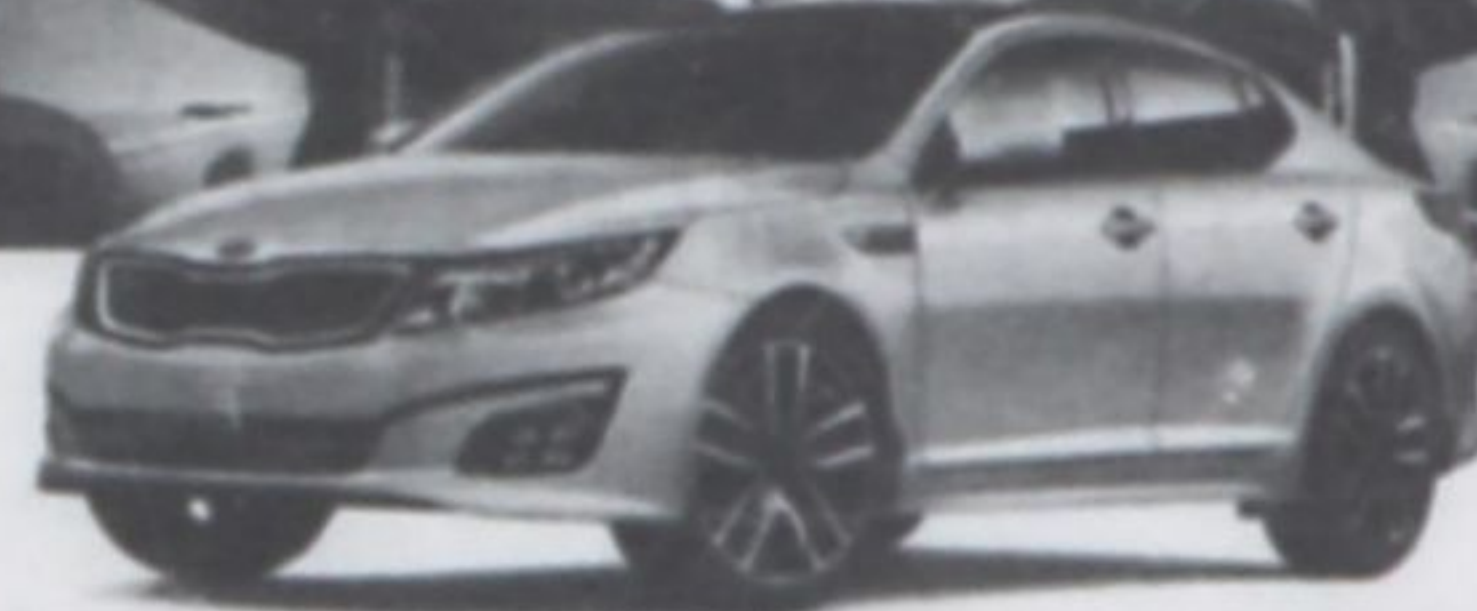
Optima SX AT Turbo shown*

AVAILABLE FEATURES: HEATED FRONT & REAR SEATS | PUSH BUTTON START