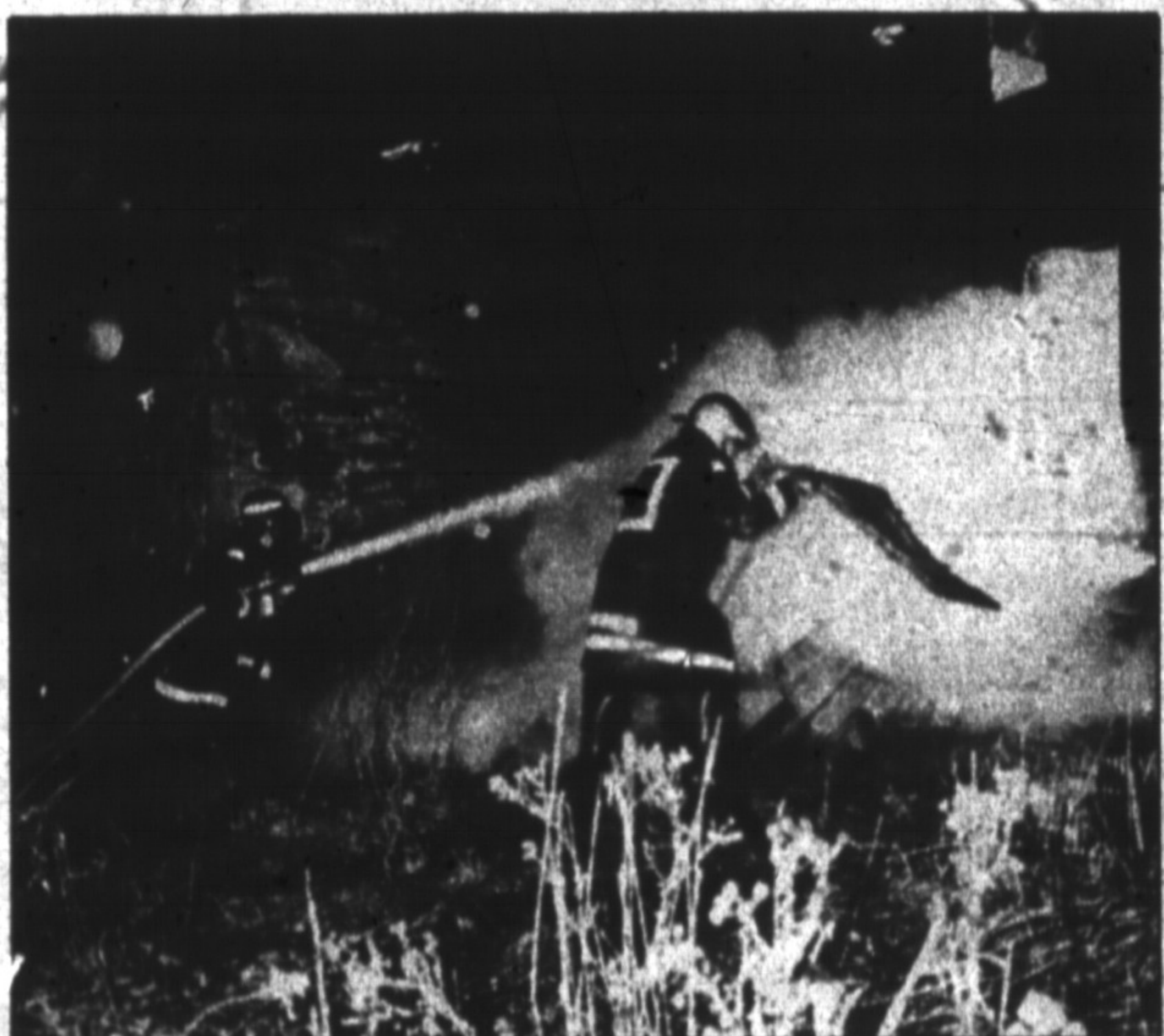
Firemen faced much debris while trying to put out the fire.