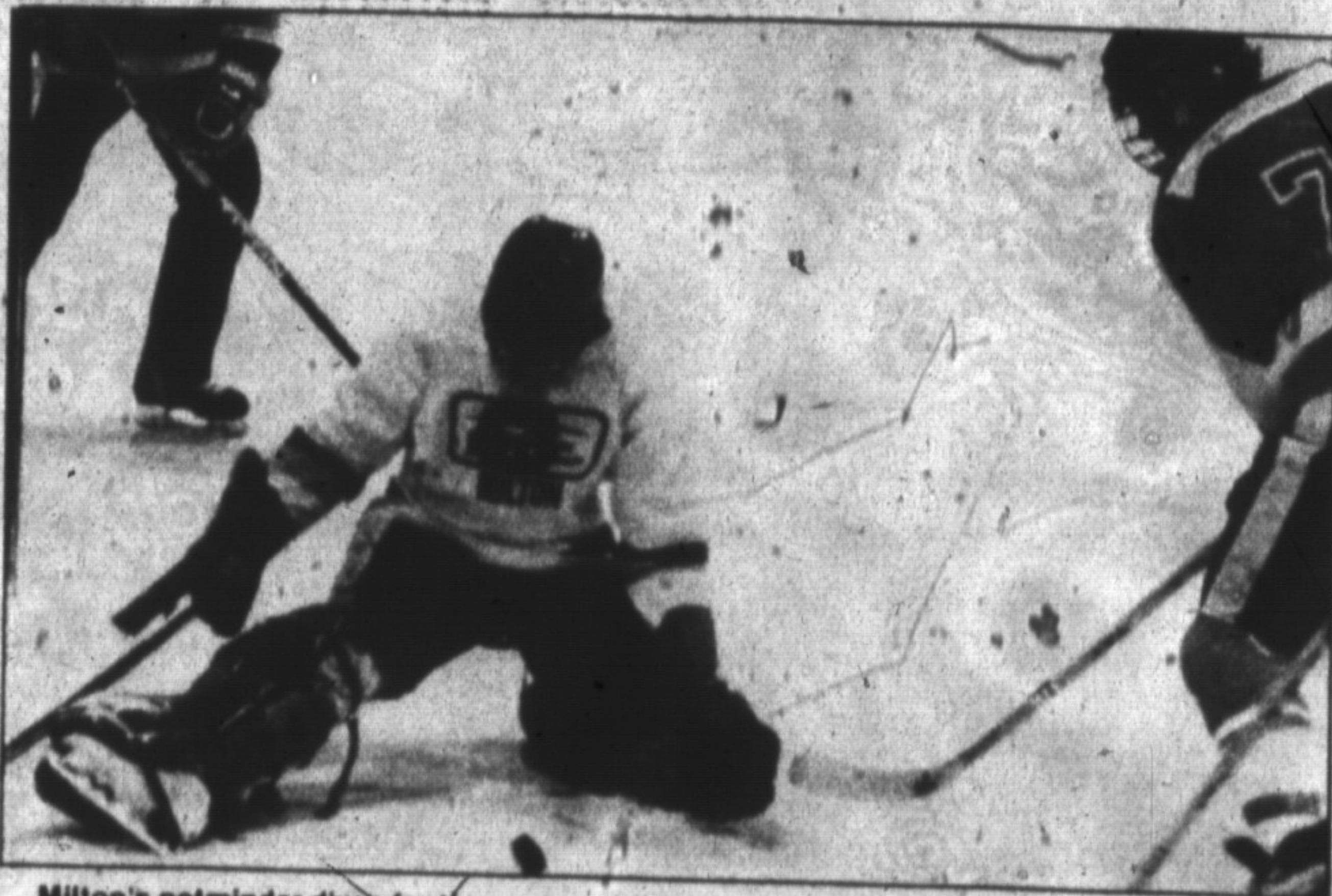
Milton's netminder dives for the puck as an Orangeville shooter moves in Sunday. The game was marred by penalties.

"We could have called a lot more," said one official after the game.