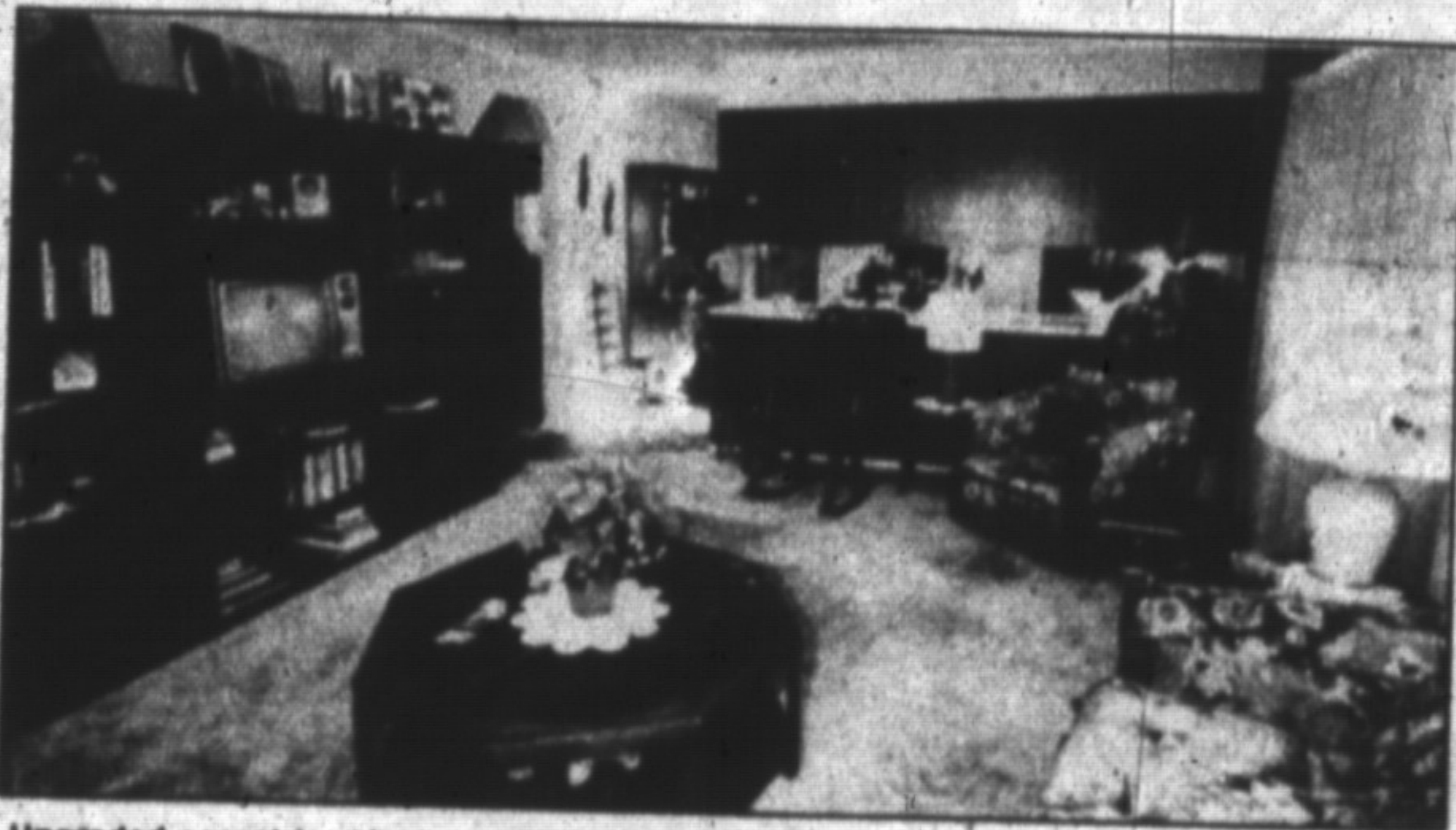
Upgraded carpet is a feature of the formal living room.