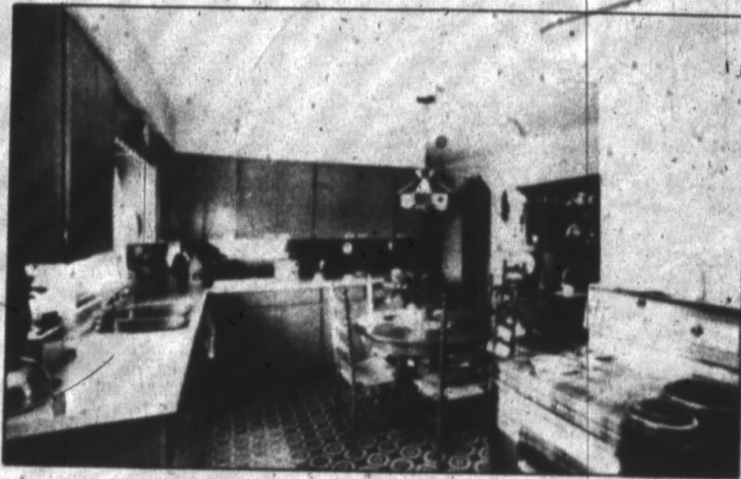
The bright kitchen provides plenty of room for the active cook.