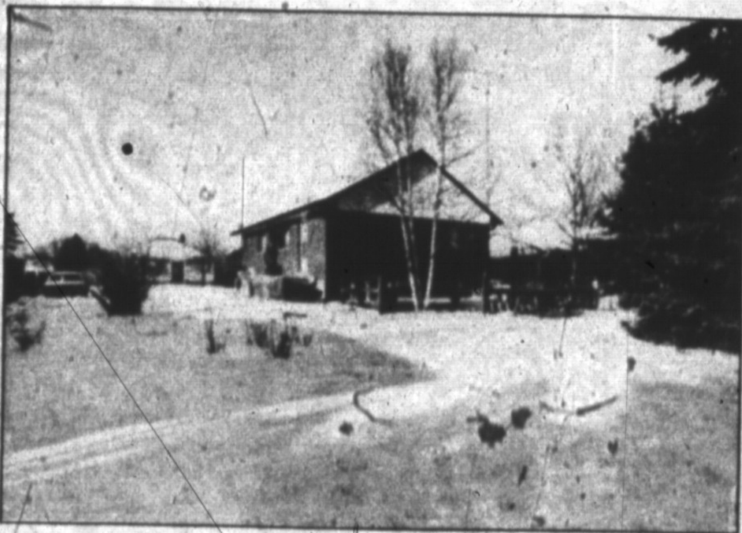
A large cedar deck and a utility shed add to this home's appeal.