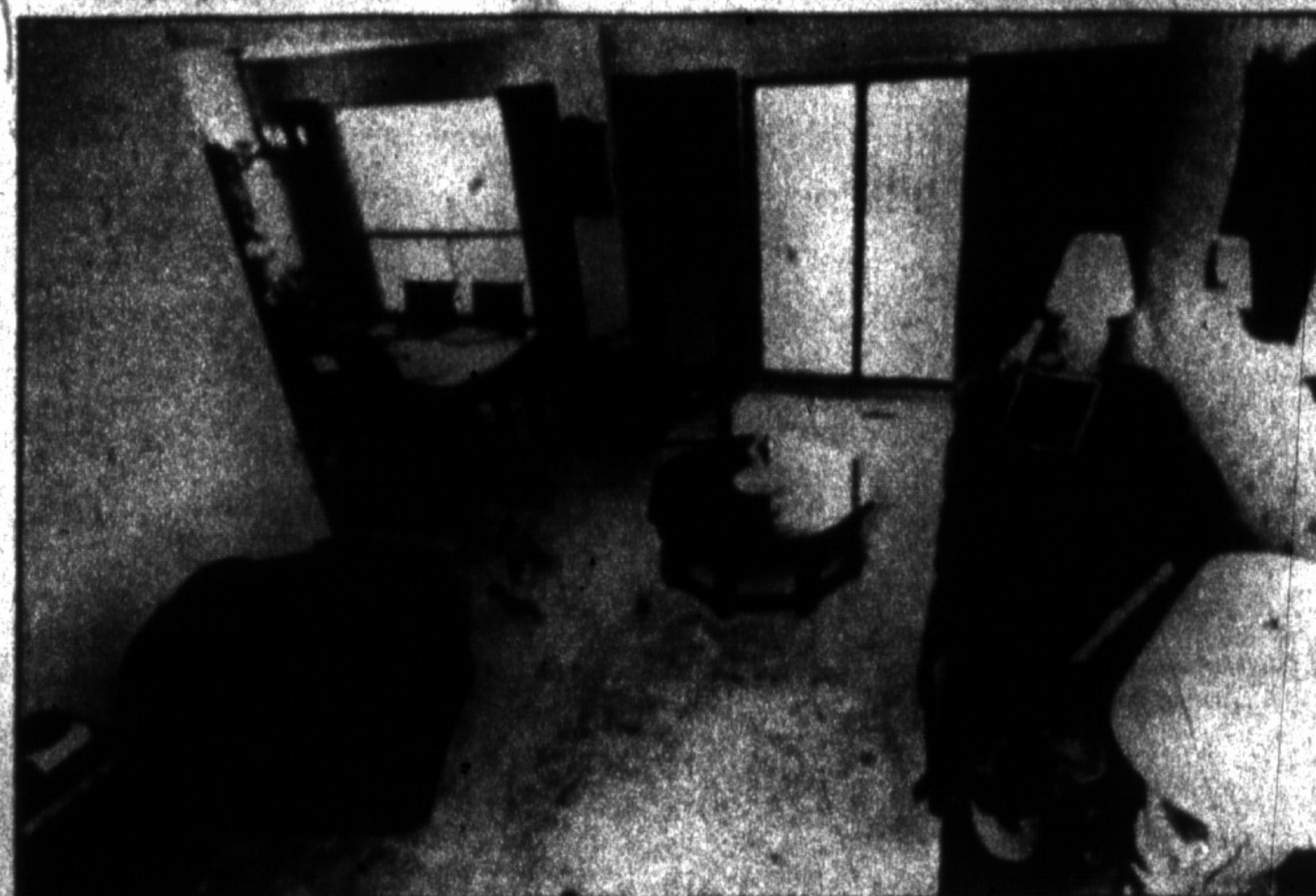
The spacious living room and formal dining room are adjoining.