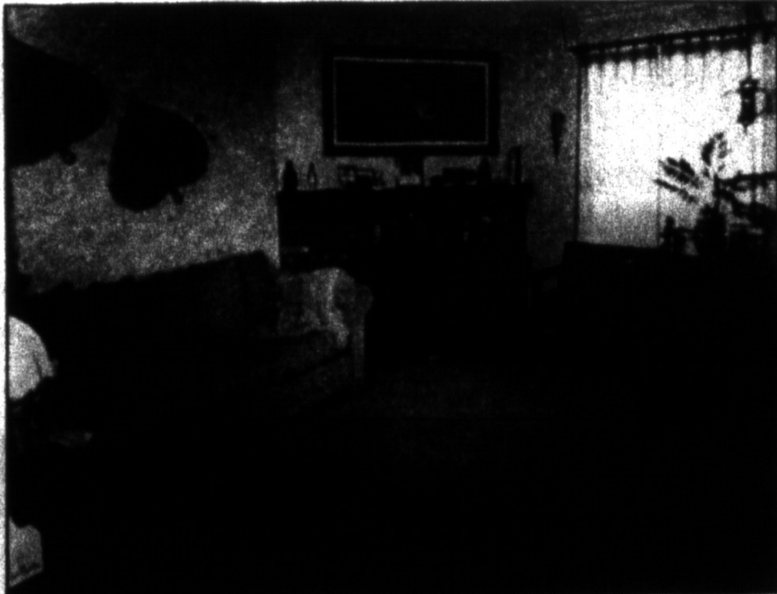
Corner fireplace give a cozy appeal to the family room.