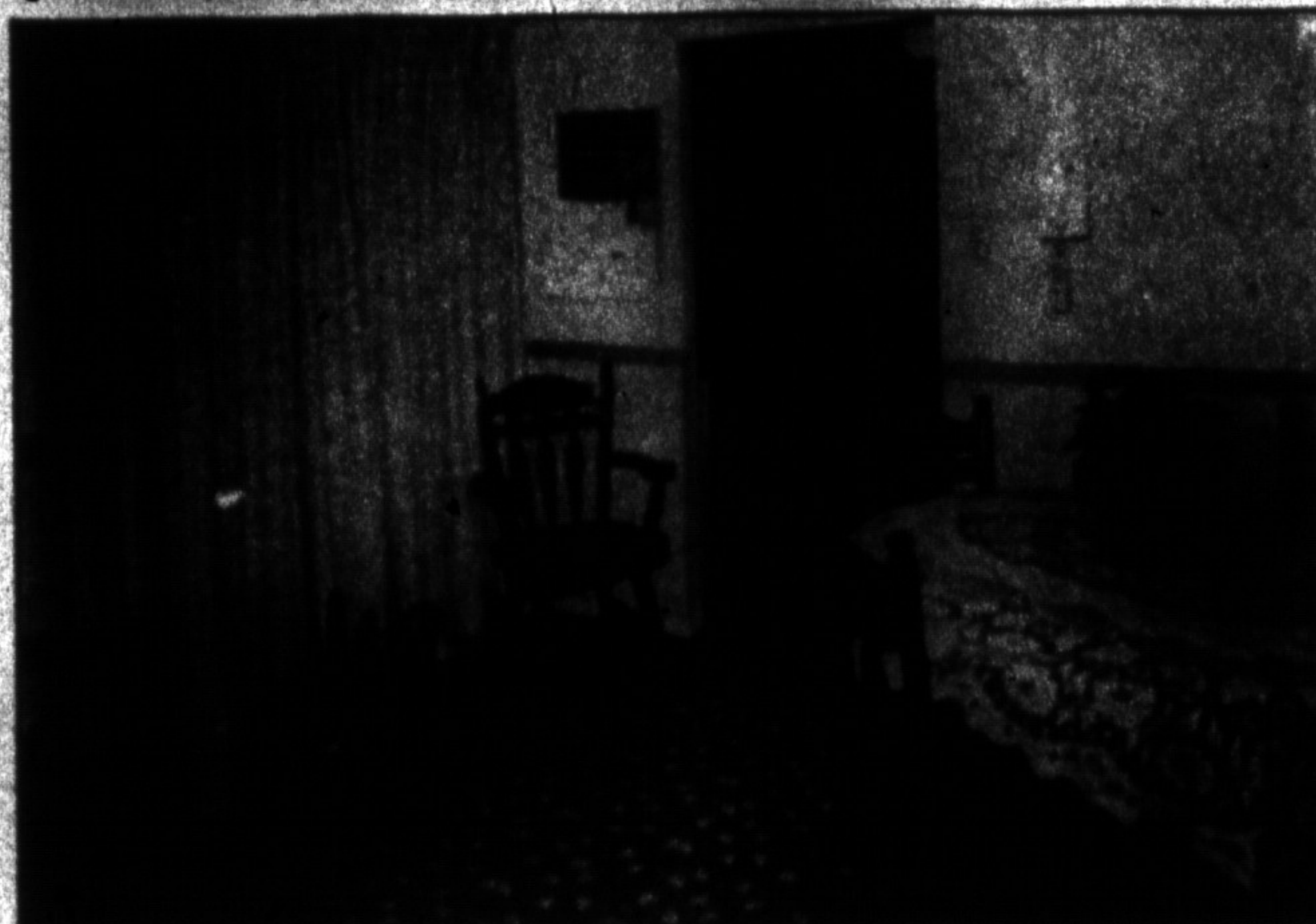
For everyday meals there is a separate area off the kitchen.