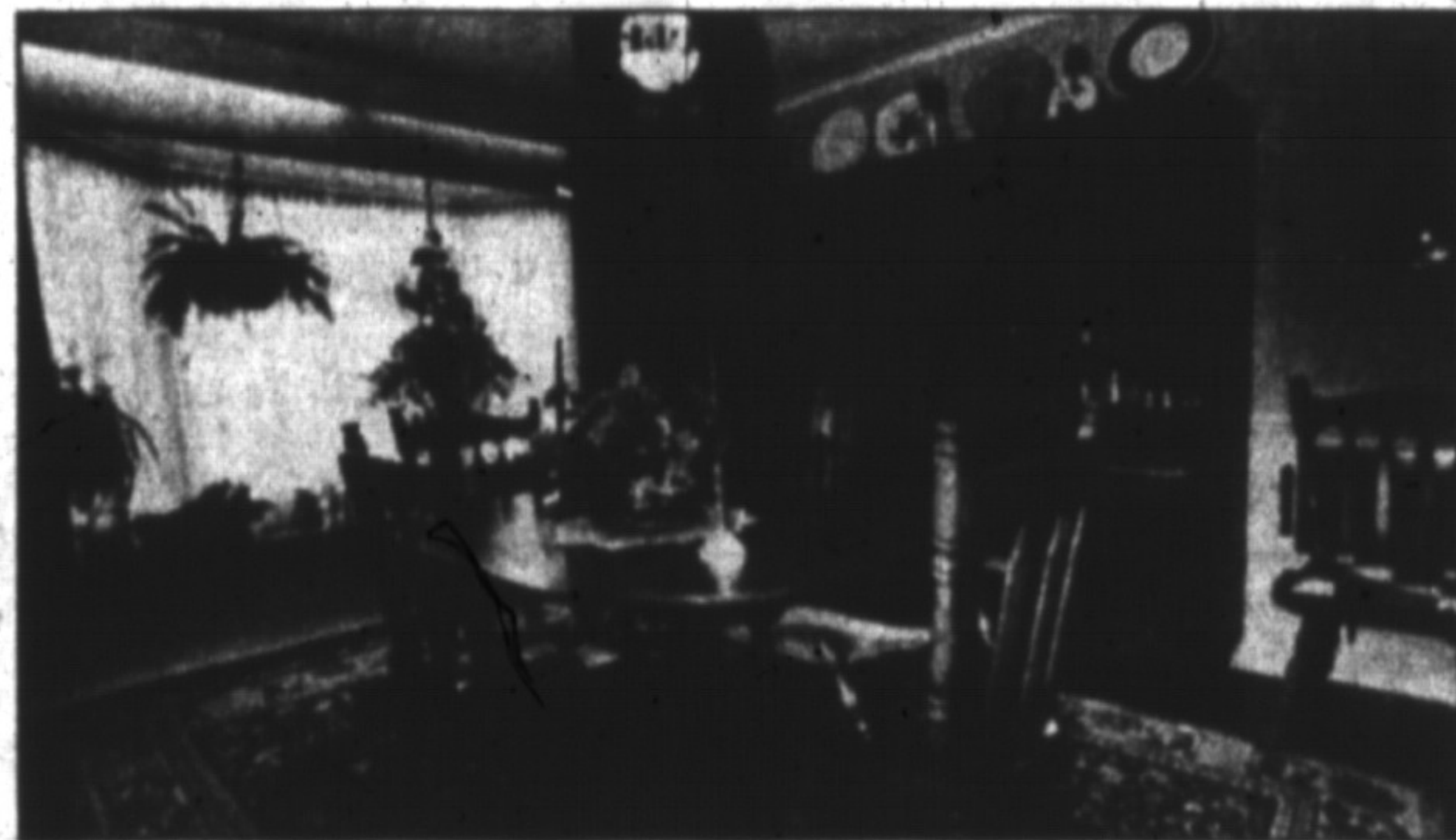
Beautiful formal dining room with bright bay window