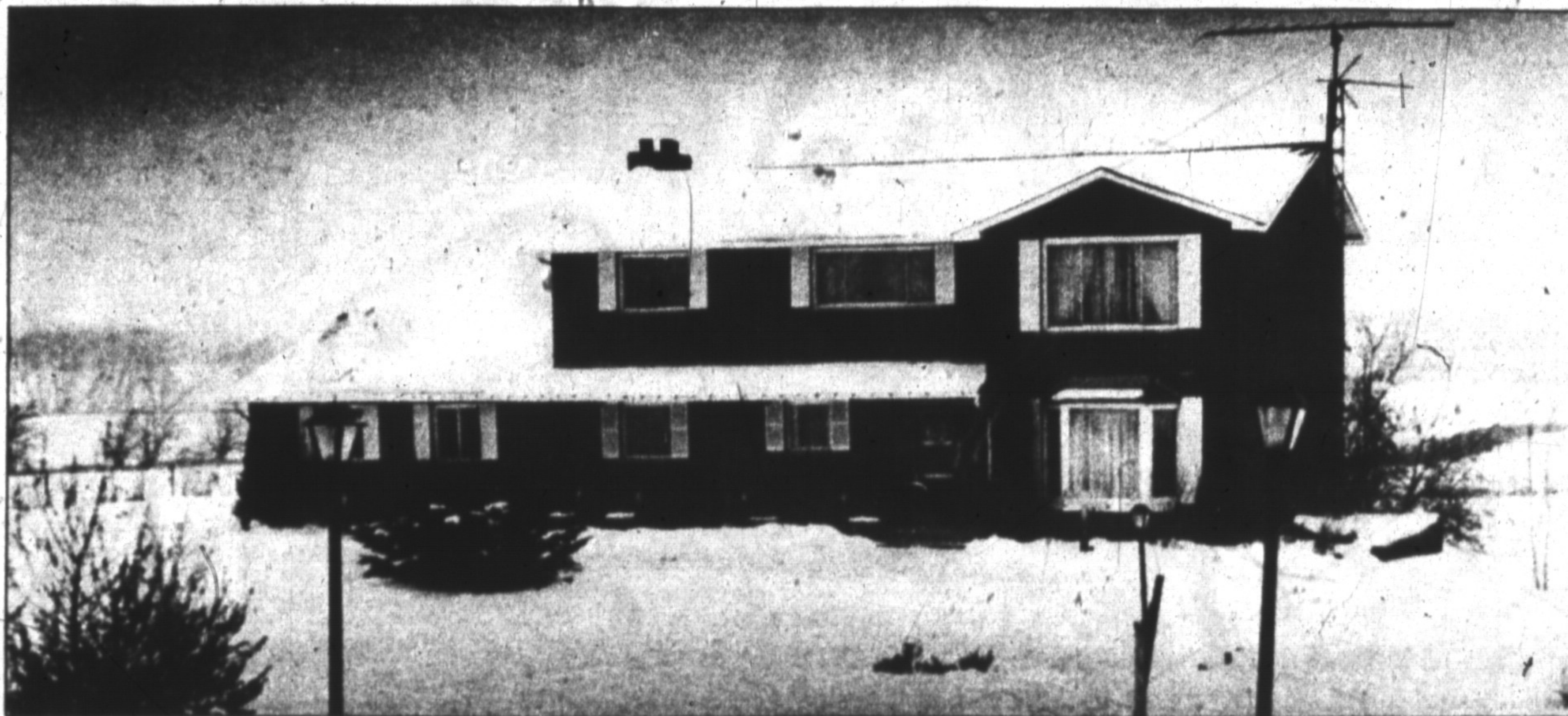
This country home gives you the freedom of the country yet only minutes from town.