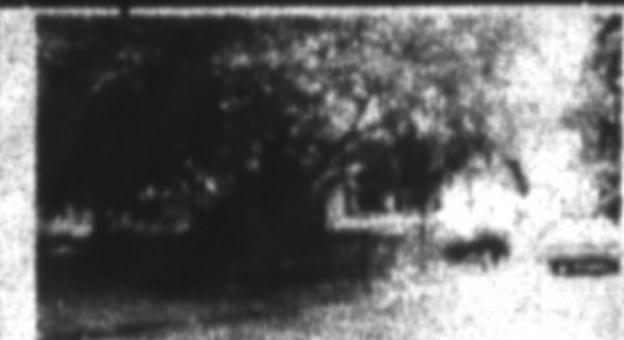
Don't wait! Your family will love this handsome ranch styled bungalow, located in Burlington & priced at $129,900. 82