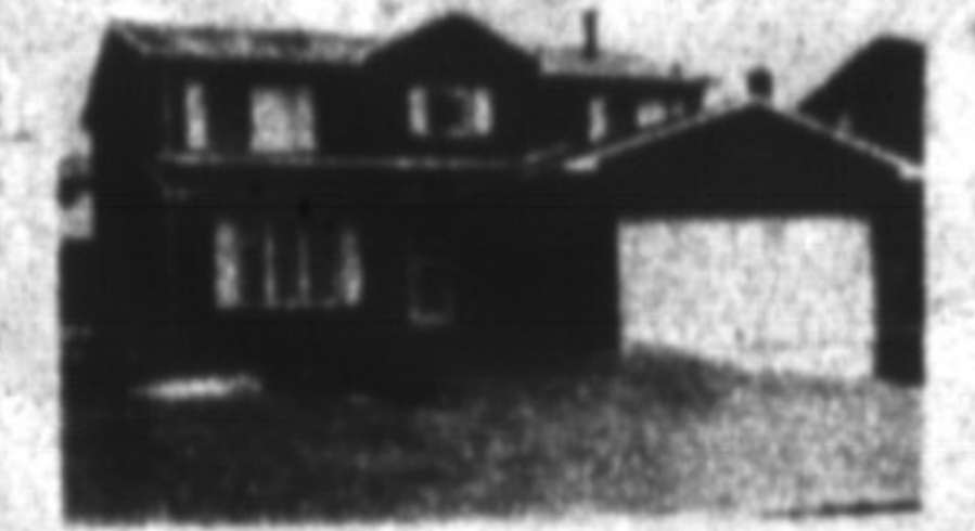
Stylish & spacious home found in an attractive & friendly neighborhood. $81,900. 115