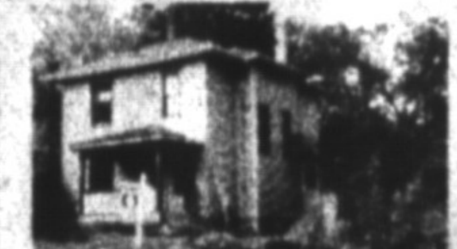
Gorgeous restored home, completely finished in select pine & offers many extras! $167,900. 80