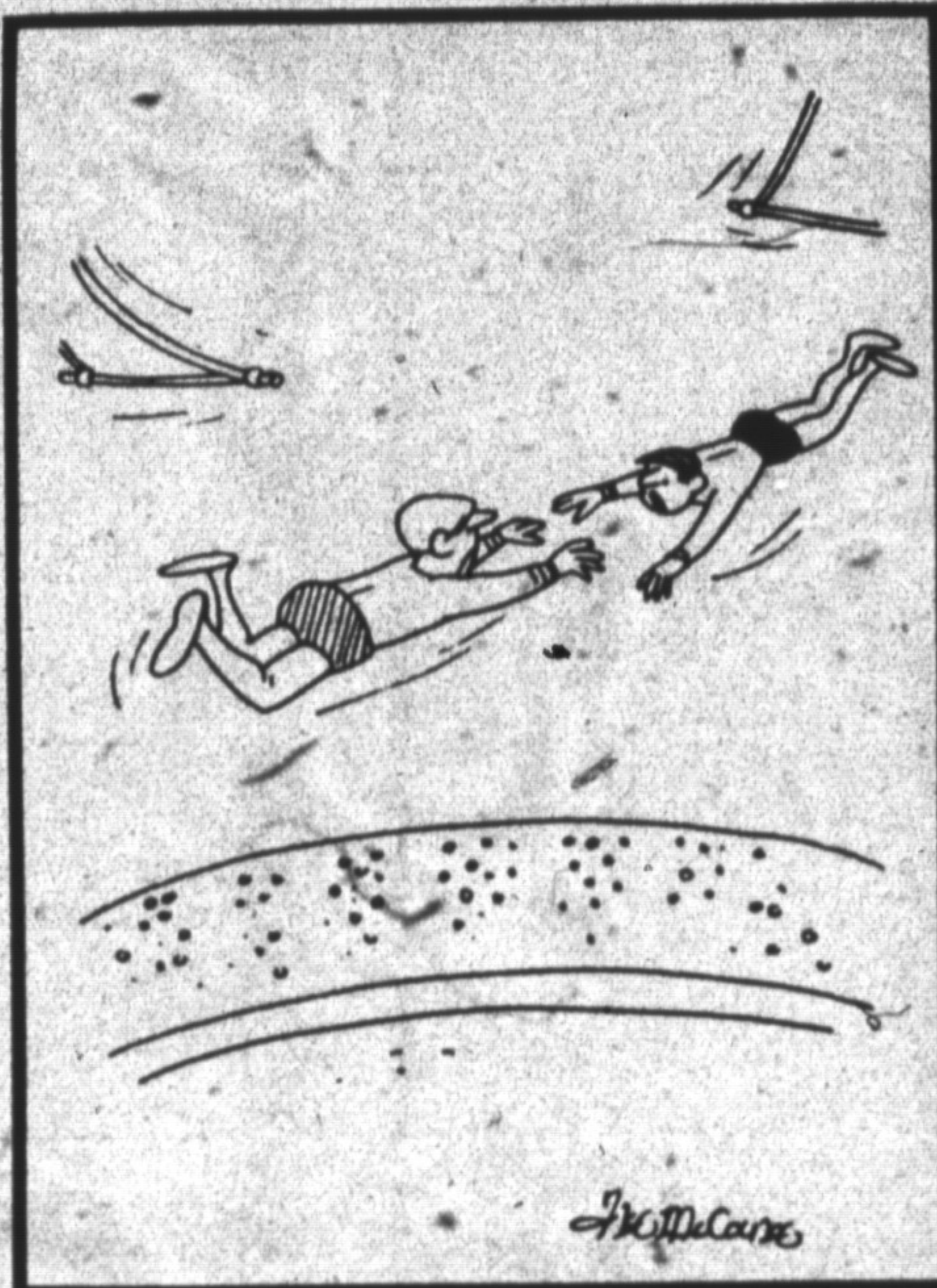
"Dummy, it was your turn to catch me!"

If your woodland is suitable and in need of treatment, we will also mark the trees that should be removed to improve the stands growth and quality; assist in marketing the marked trees, and provide you with sound advice on arranging your sale. It's all free—because it's good for you and good for Ontario!