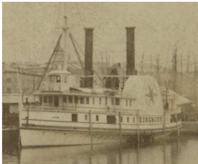
Detail of the Kingston from stereoview