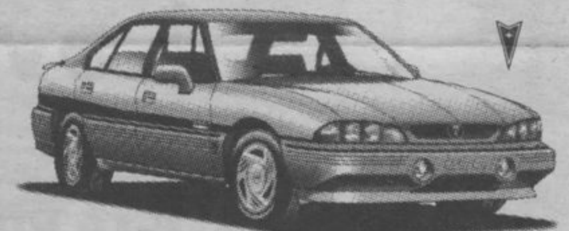
1992 PONTIAC BONNEVILLE