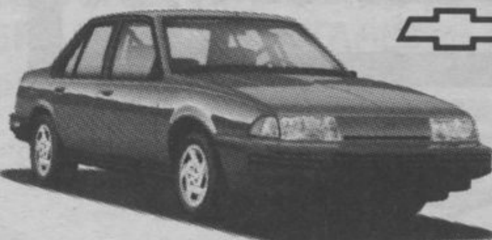
1992 CHEVY CAVALIER