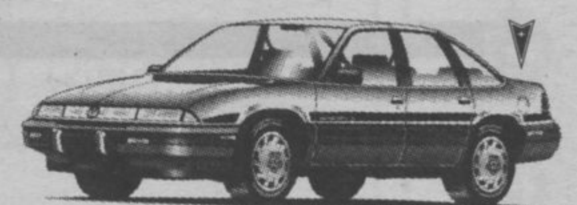
1992 PONTIAC GRAND PRIX