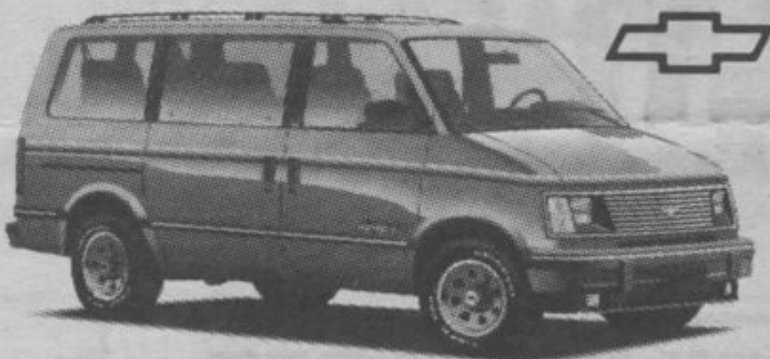
1992 CHEVY ASTRO

Now the car, van or truck you've always wanted is within easy reach with interest rates frozen at 2.9% for 48 months. Or cash backs as high as $3000 on a huge selection of '92 models.