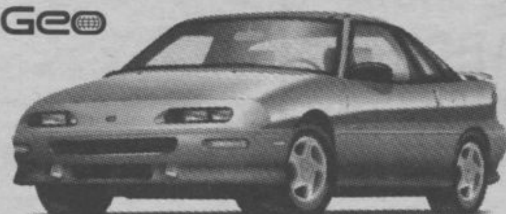
1992 GEO STORM