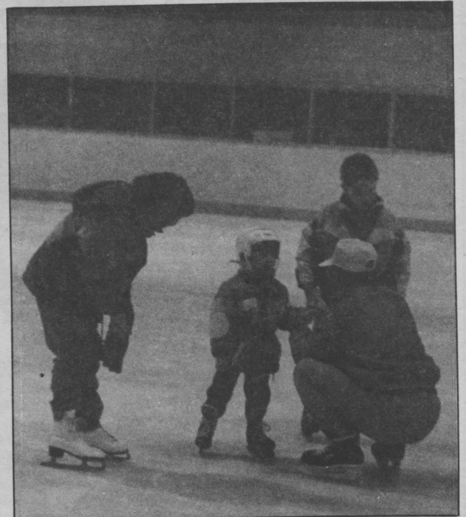
With the exception of hourly 10 minute breaks—and a 20 minute lunch break at 3 pm—skaters stayed on the ice from 12 pm to 6 pm.