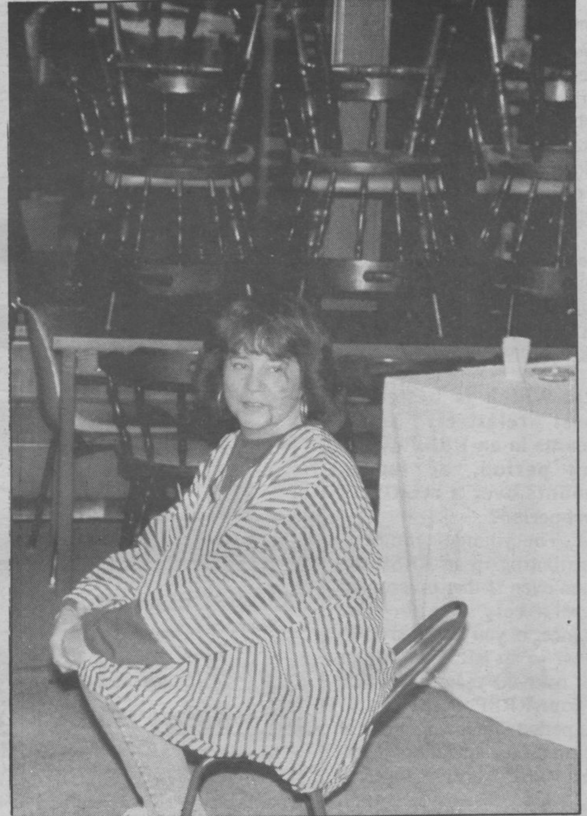
Some of the accused actually attempted to take the law into their own hands (above), while others (above right) showed evidence of police brutality—and had the make-up to prove it. Fortunately, most simply submitted to the verdict of the court (right), however suspect the quality of the justice might be. The event took place in the Terrace Bay Curling Club, and was broadcast on Community Channel 13 in Terrace Bay.