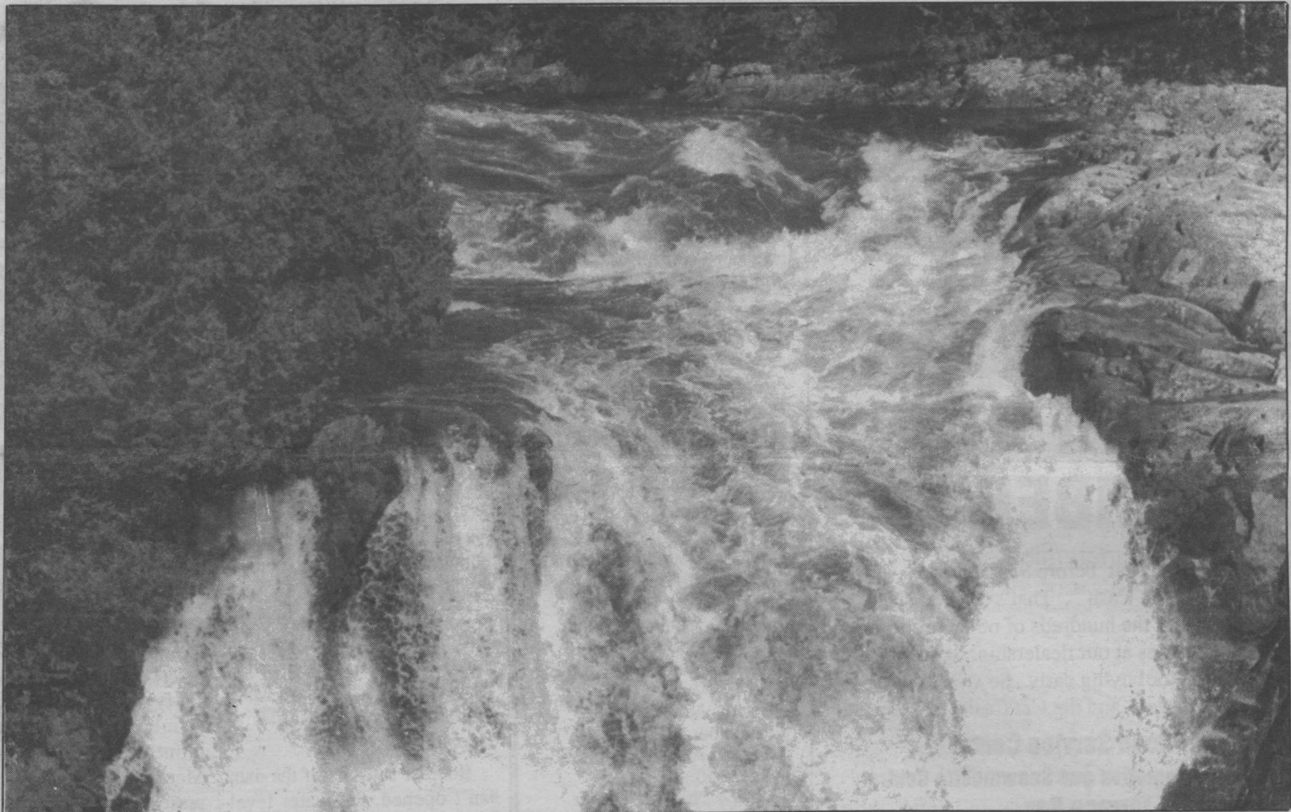
Because of the recent heavy rains, Ontario Hydro has opened the Hayes Lake Control Dam, giving us this spectacular view from the Aguasabon gorge. Hydro expects the dam will be open for about a week. More on page 2.