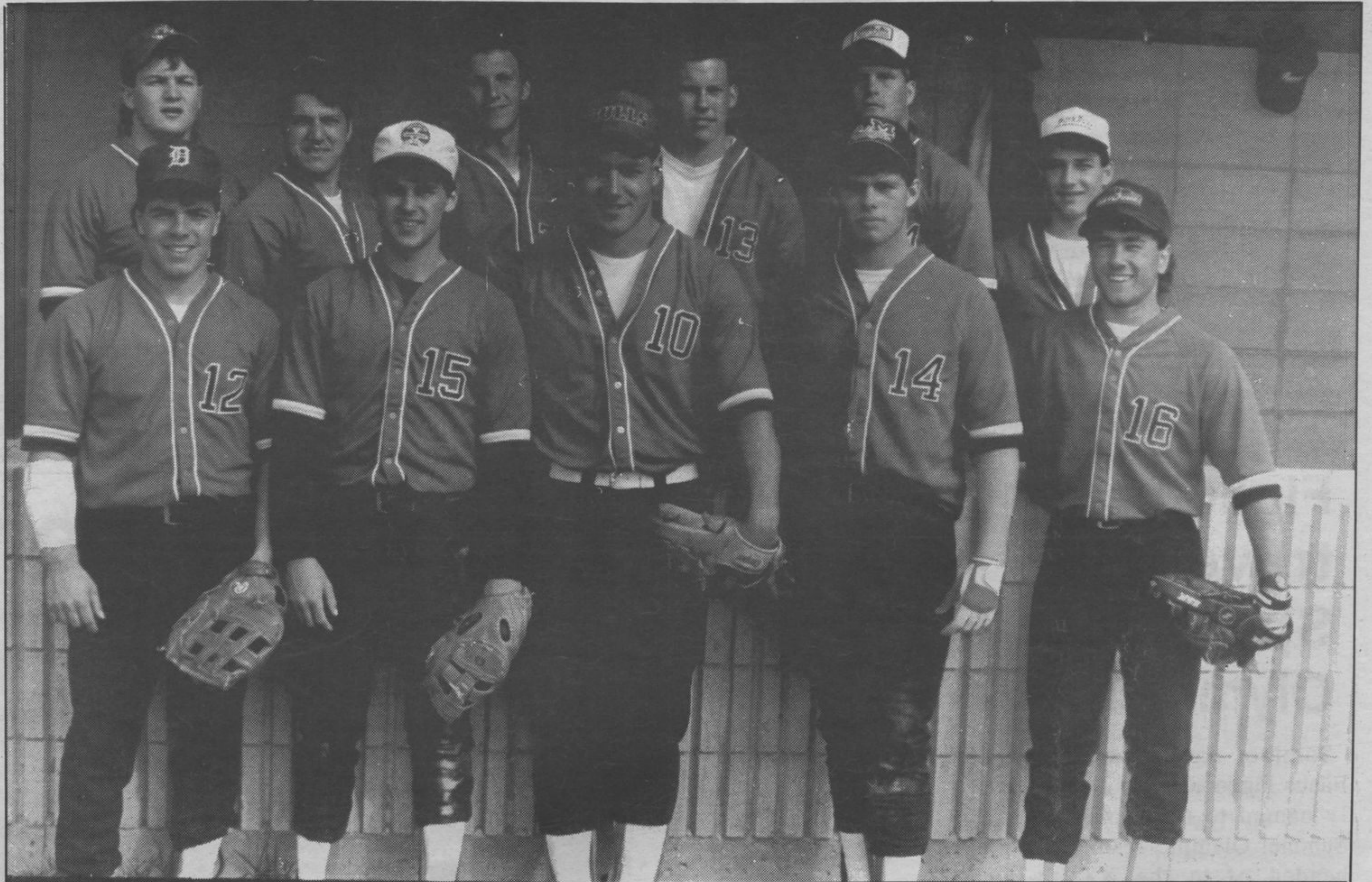
Crimestoppers came into the championship round down one game. By playing hard in the first game, they eventually defeated Stompers, forcing a winner-take-all final, which they also won, taking the championship

Stompers rallied once again, putting up three more runs, continued on page 3