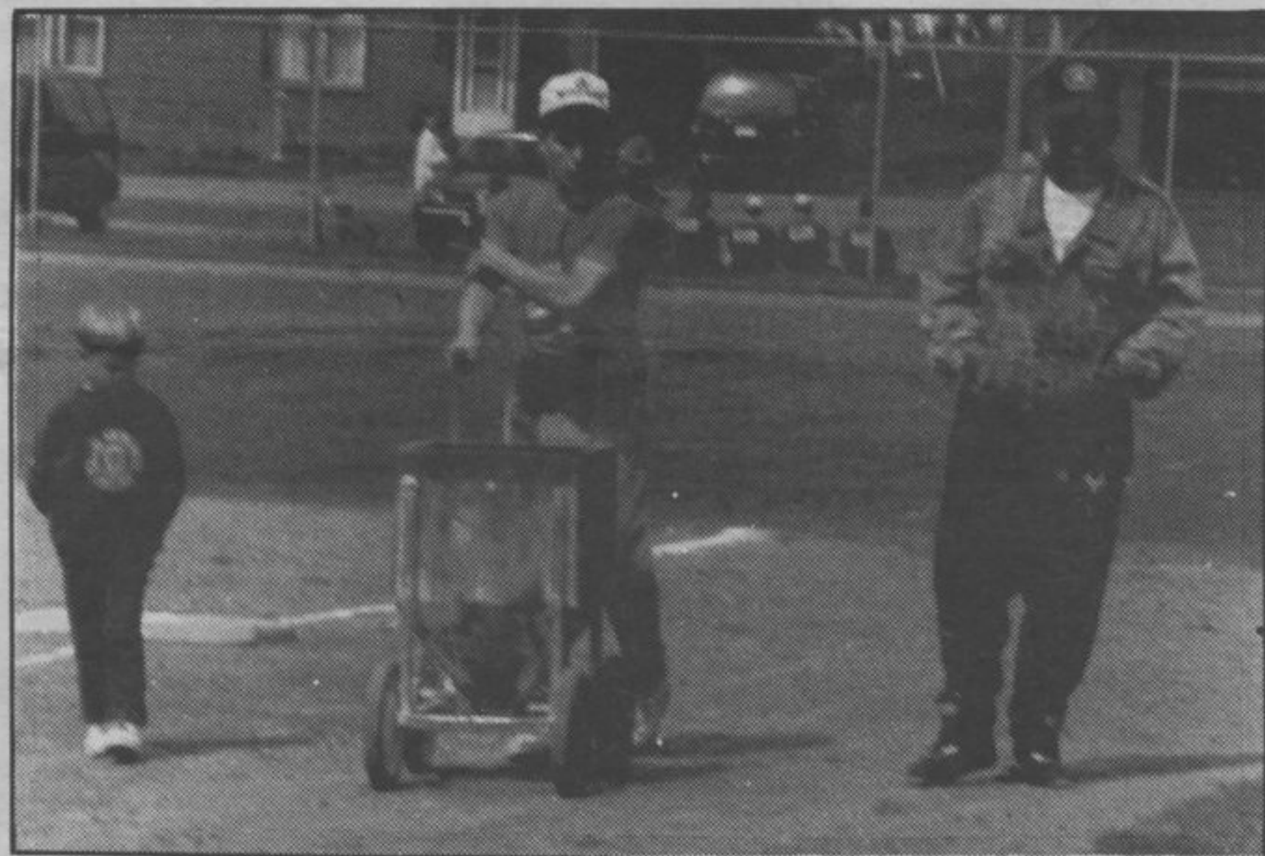
Taking care to prepare the field for the next game