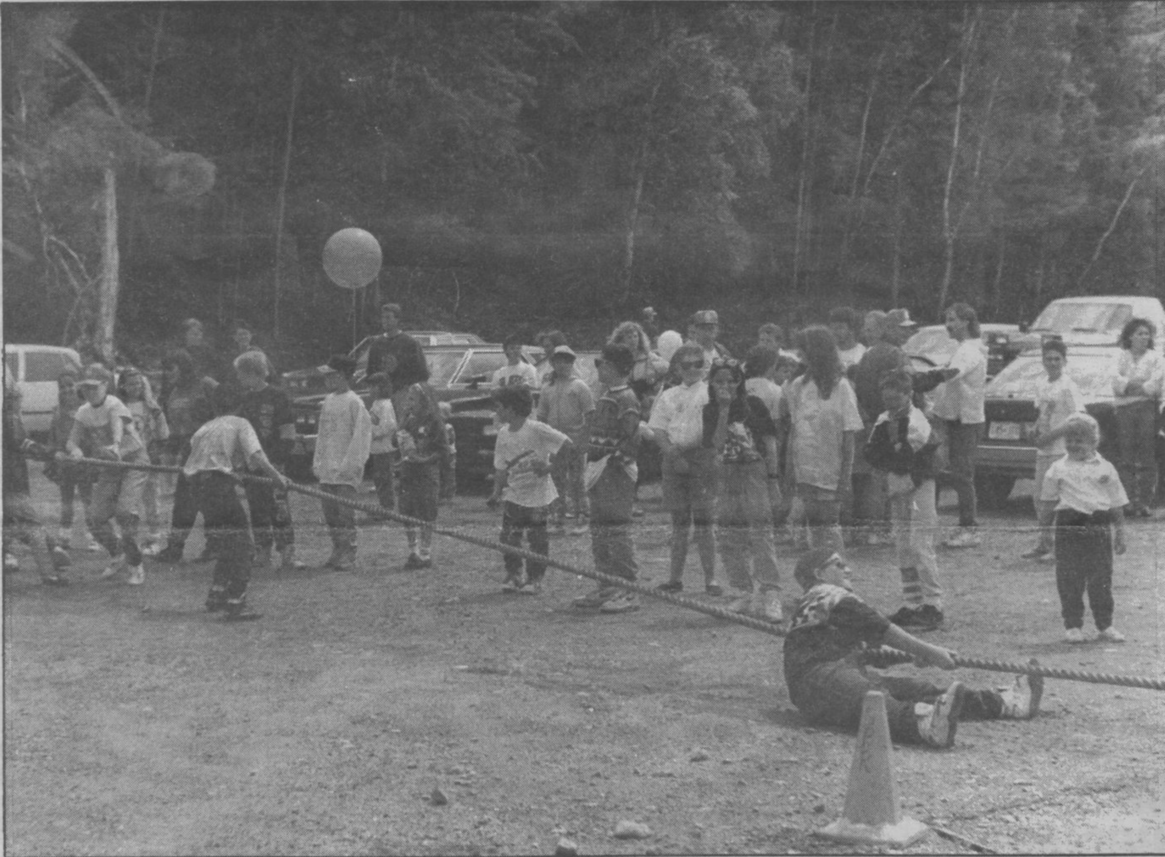
There was a good turnout for this year's CPR picnic, despite the less than summery conditions. The event was moved to the Schreiber recreation centre because of the cold weather, but the rain stayed away and picnic events, including the children's tug of war (above), went off without a hitch.