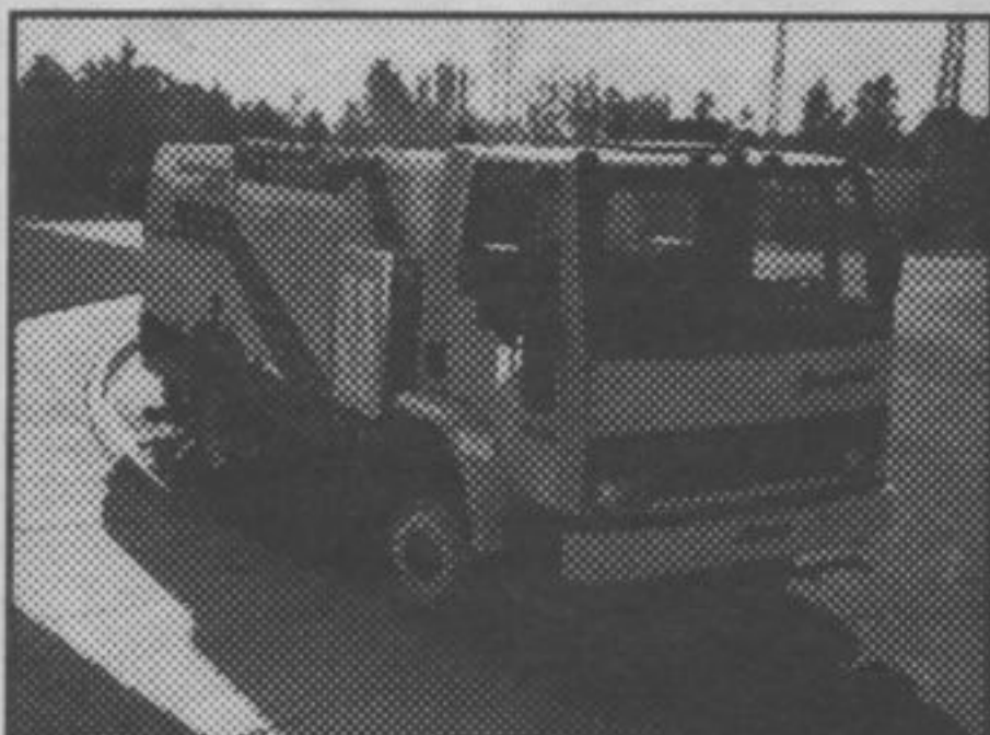
SWEEP RITE MANUFACTURING INC., REGINA

We have to invest in ourselves and be a country that says ... yes we can.