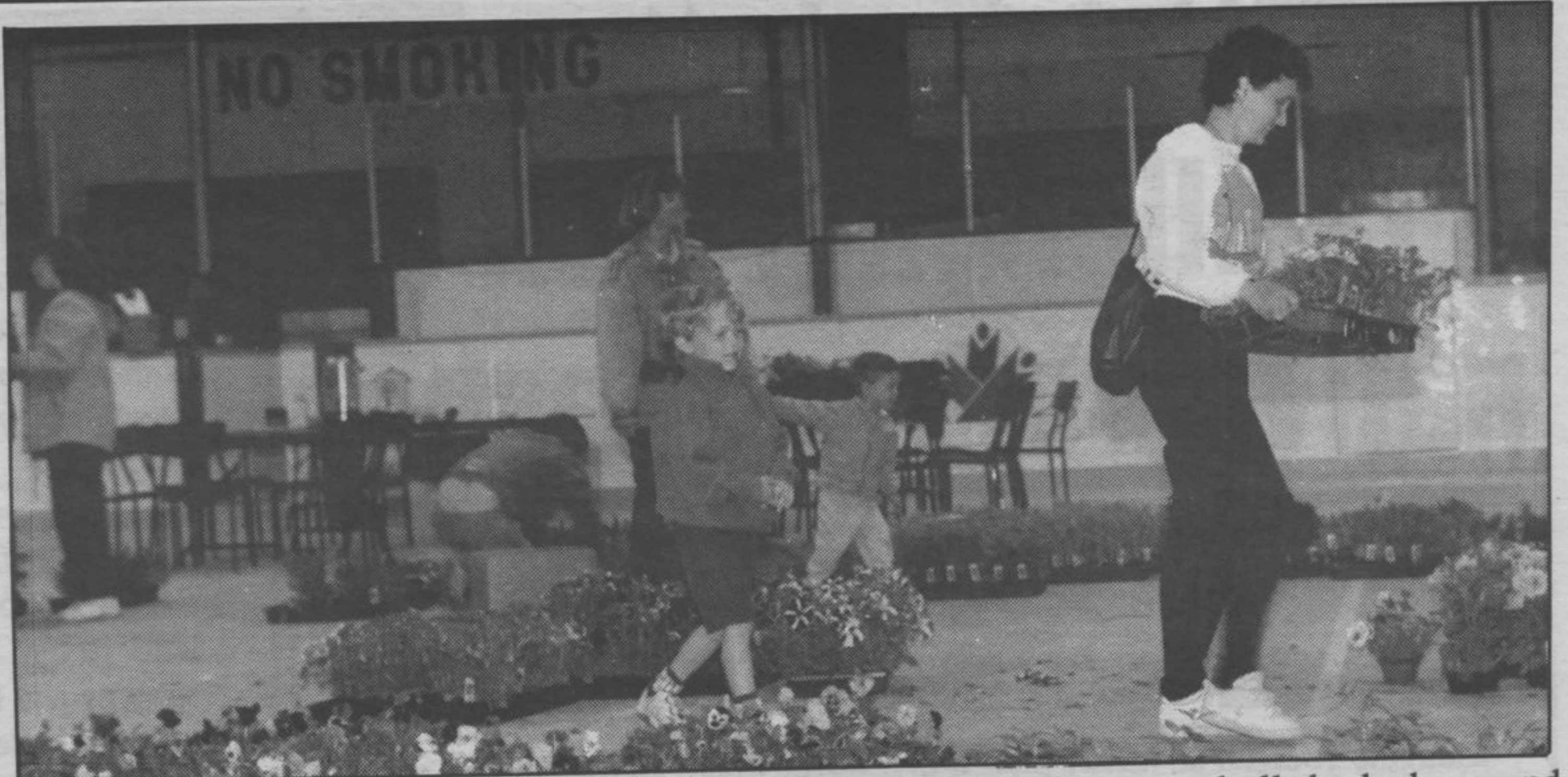
The sale (above) was held at the Terrace Bay arena.

150 people lined up at 8 am to get first choice of the flora on the floor. Some of the more popular items included marigolds,