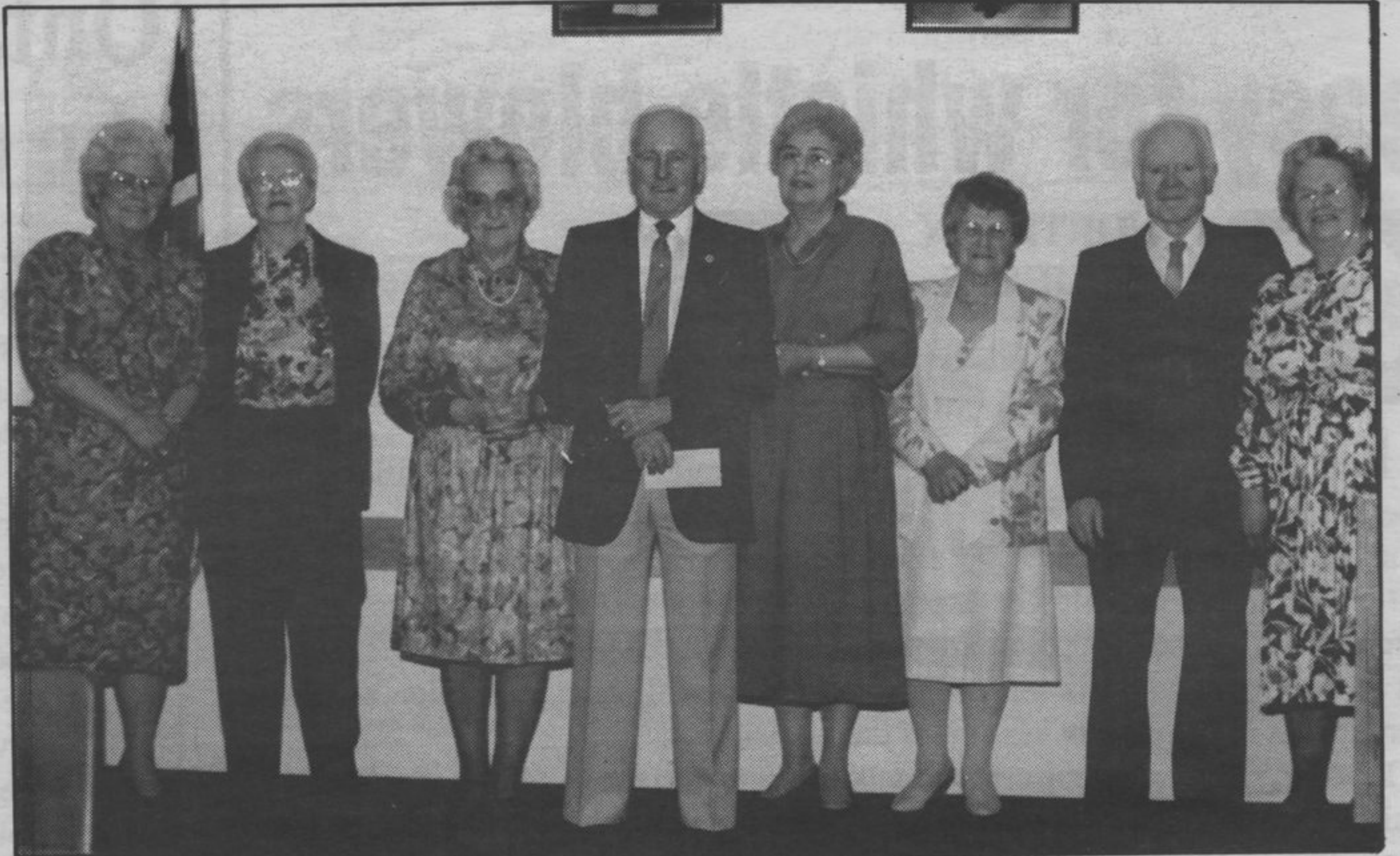
The Chimo club held its awards banquet May 12, giving out awards to both shuffleboard players and to