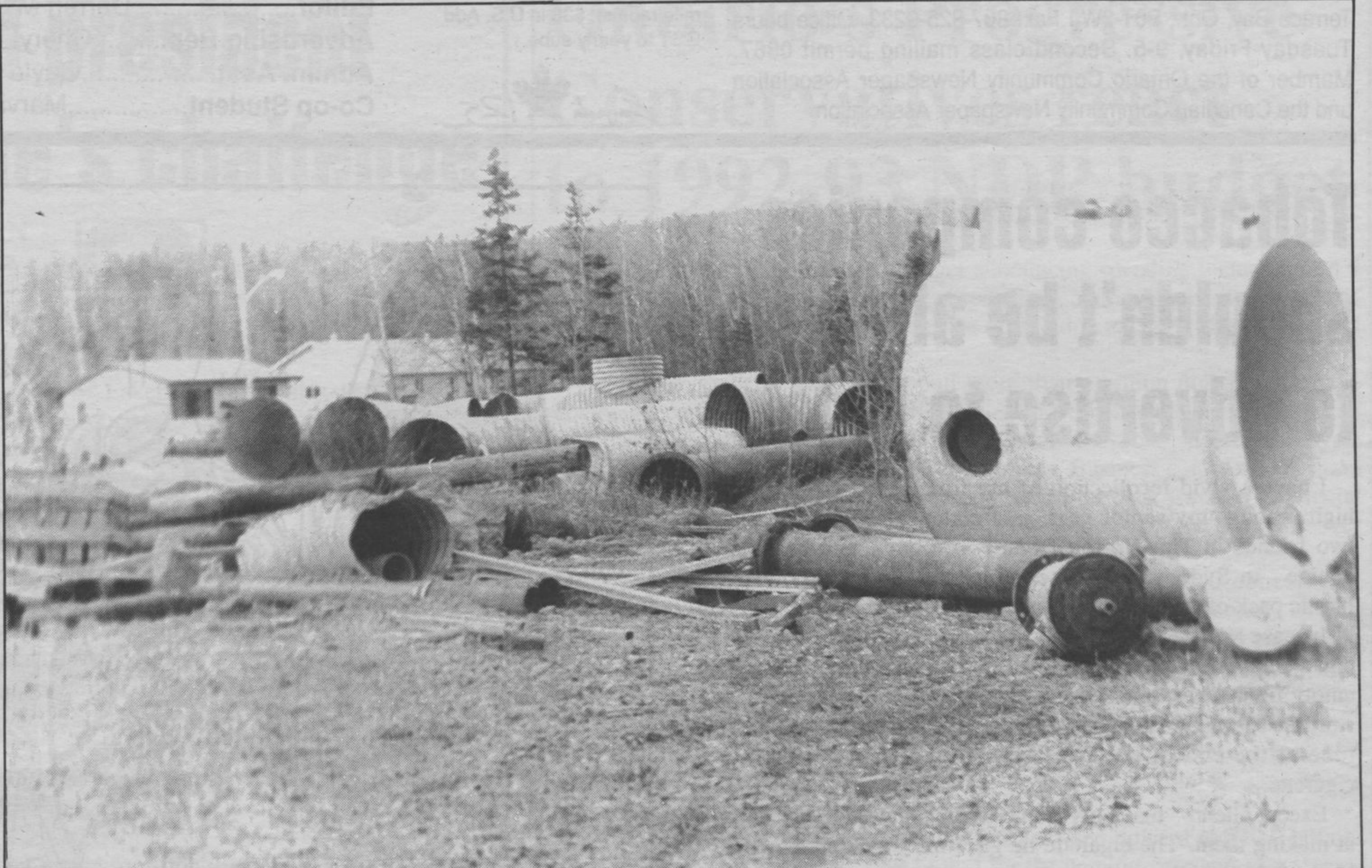
Some Peary Street parents say the culverts are a hazard to kids.